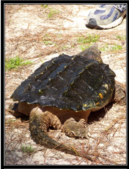
Alligator Snapping Turtle (Macrochelys temminckii) E O Wilson Biophilia Center