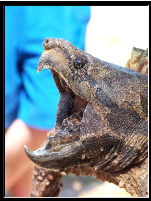
Alligator Snapping Turtle (Macrochelys temminckii)

Like the misidentification of the snapping turtle in general, most snappers are incorrectly identified as “alligator snappers”. The Alligator Snapper ( Macrochelys temminckii ) can be identified from the Common snapper by the presence of three rows of raised, vertical scales along the upper surface of its carapace; there are no vertical scales on the tail. This turtle is found throughout the Mississippi Valley area but only found in the panhandle of our state. It is mostly nocturnal and spends most of its time on the bottom of rivers and floodplains of major rivers such as the Escambia, Alabama, and Apalachicola; there are reports of this animal in brackish water conditions. This species is famous for its “fishing lure” tongue which, along with its well camouflage mouth, is used while sitting very still for long periods of time either in the mud or under a log at the bottom of a river or associated floodplain habitat waiting for a fish to “take the bait.” The males of this species are known for their bad temperament and there are stories of them ripping body parts or holding on and never letting go. Actually the common snapper has the bad temperament and seems to be more eager to “snap” at you than the alligator snapper.