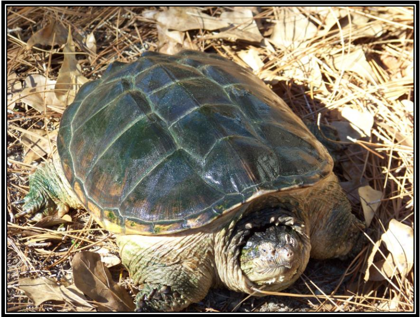
Common Snapping Turtle (Chelydra serpentina serpentina) Roy Hyatt Environmental Center